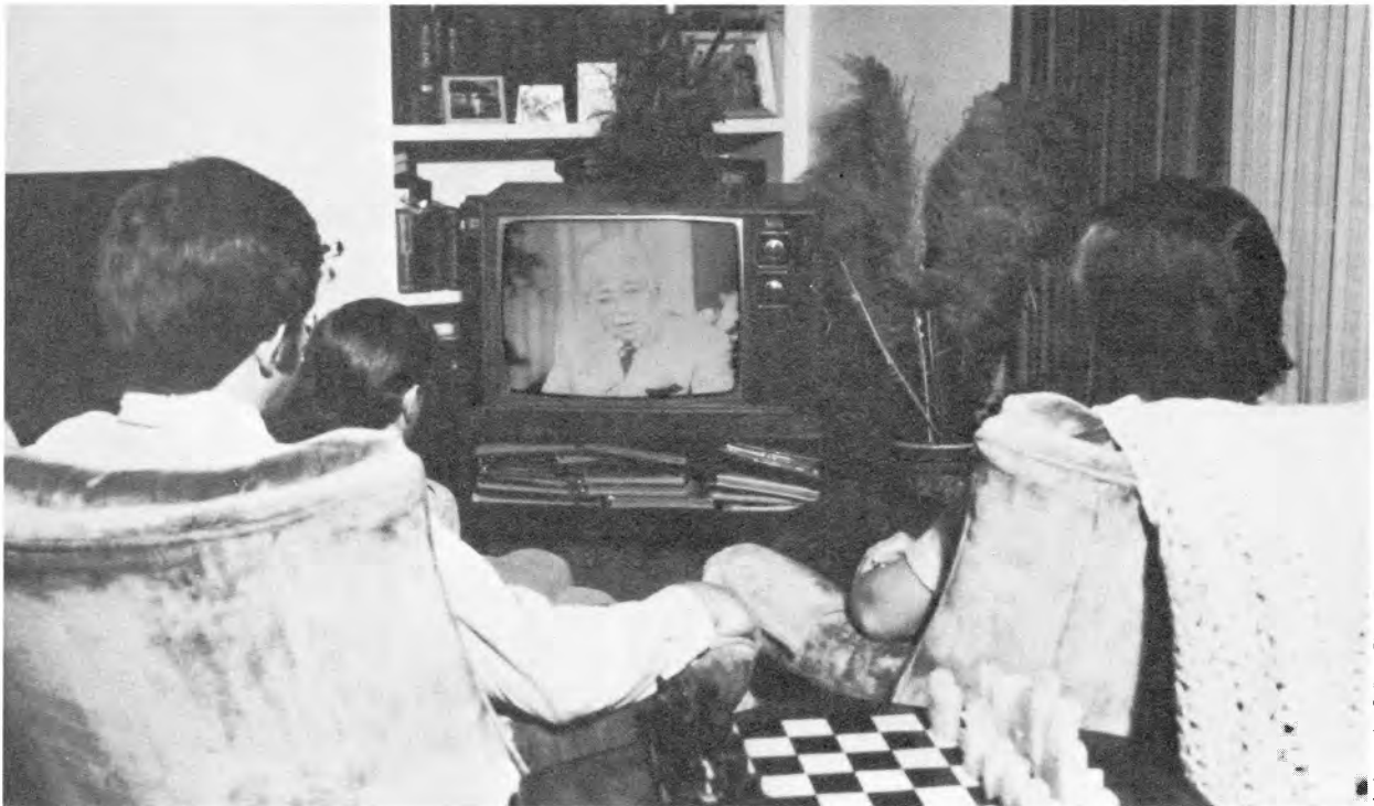
Ambassador College Photos